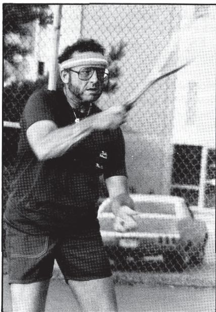
7 a.m. tennis before morning clinic at Jazz Festival.

ES: I don't do a lot of record dates because most of them conflict with the Tonight Show, and as a result, a lot of contractors don't call me anymore. I can't be away from the Tonight Show very often; I try to save my leave time, which Doc is very generous about, for my clinics and my road work. I would say that most of my time outside the Tonight Show is spent traveling and doing clinics.