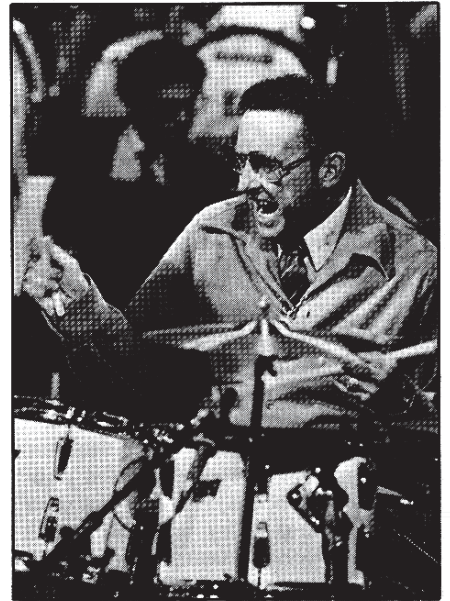
Solo spot on "Tonight Show" 1985.

Here's a 1985 bit where Johnny Carson showed a few band members with "The Perfect Body."